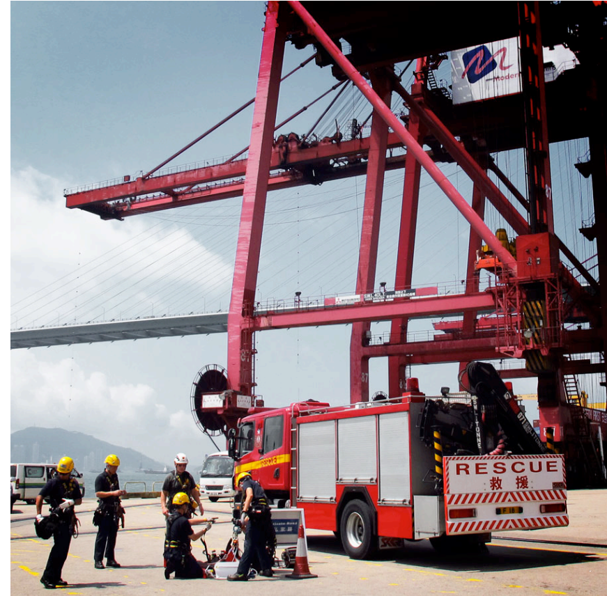
DAS working with HKFSD on a rescue exercises at cargo terminal