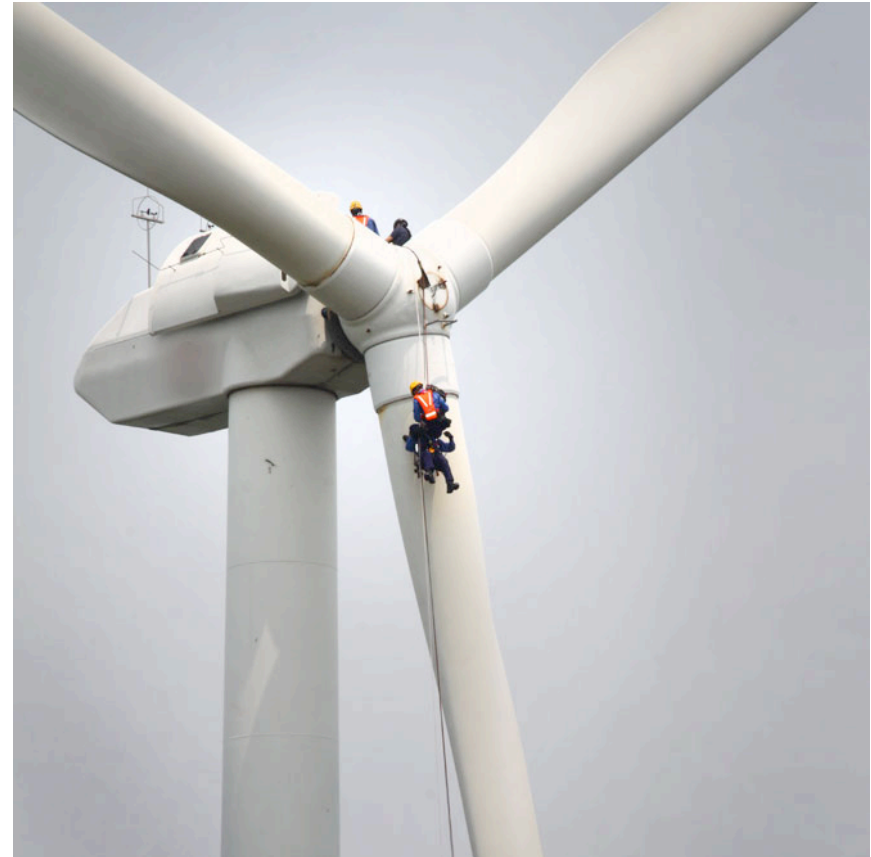
DAS providing high angle rescue training on wind turbines